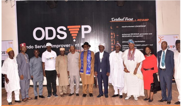
Launch of Ondo Service Improvement Programme