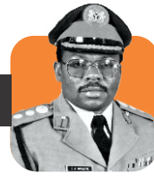
Colonel Ekundayo B. Opaleyeye fss, psc, mni