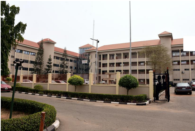
Ondo State Secretariat Complex (Governor' Office)