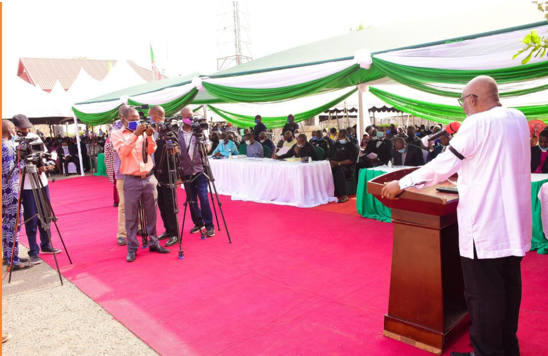
Mr. Governor addressing workers at the 2021 1st Working Day Prayer Session