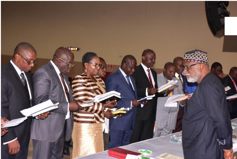
Mr. Governor swearing-in Permanent Secretaries and Tutors-General