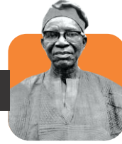
Chief Michael Adekunle Ajasin