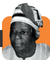
Chief Adebayo Adefarati