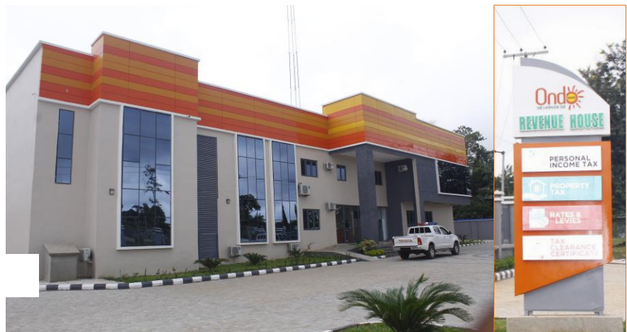
Ondo State Internal Revenue Service Complex (ODIRS Revenue House)