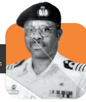
Navy Capt. Olabode Ibiyinka George fss, psc