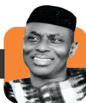
Dr. Olusegun Mimiko