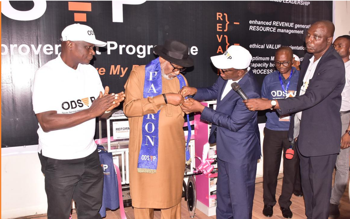
Mr. Governor being decorated as ODSIP Patron