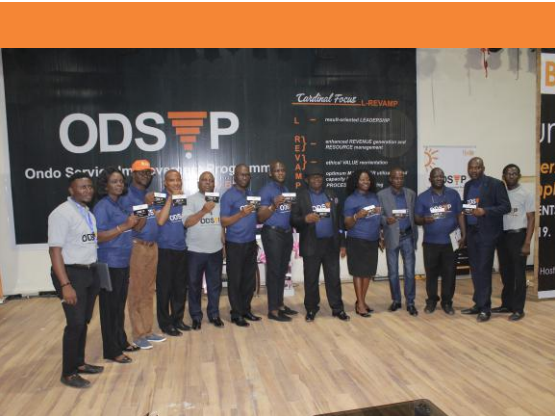
Service Improvement Committee