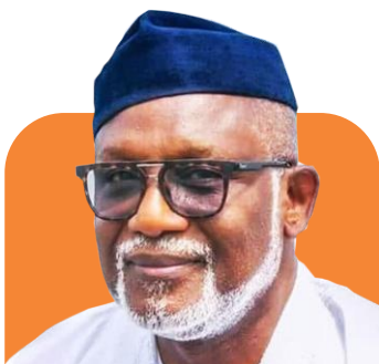
Arakunrin Oluwarotimi Akeredolu, SAN Feb. 2017 - Feb. 2021 (First Term)