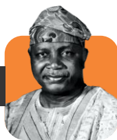
Dr. Olusegun Agagu