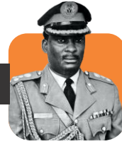
Brigadier Sunny Esijolomi Tuoyo psc