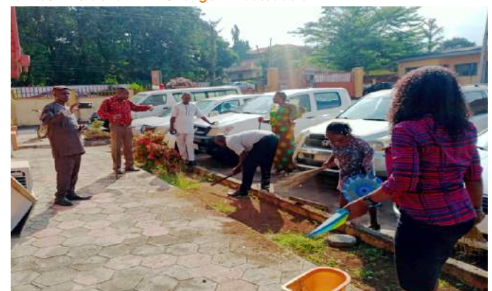
Officials of Primary Healthcare Development Agency during their monthly sanitation exercise, in accordance with ODSIP tenets.