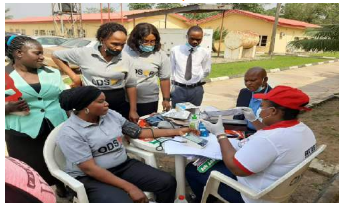
Officials of the Ondo State Agency for the Control of AIDS (ODSACA) conducting checking the vitals of Change Ambassadors at the 7th edition of HoS' Interaction with Change Ambassadors